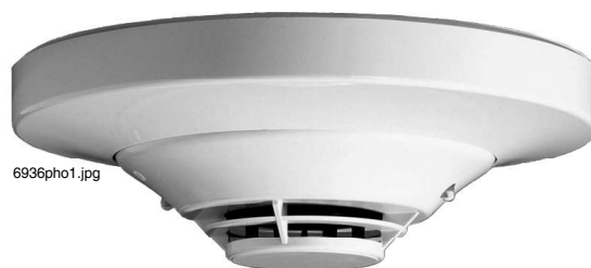
FST-851 Series in B710LP base