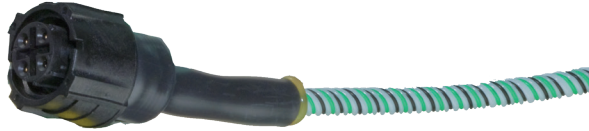
Female Connector Tip