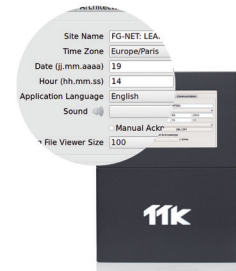
User-friendly interface of configuration