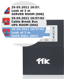
Simultaneous alarms displayed on one screen