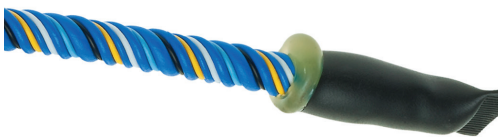
FG-ECS Sense Cable End Termination Tip

2 Communication Wires and 2 Wires for Locating